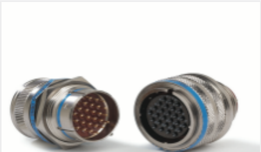
TE Part #ZPF00000000012621 DBAS 70-37-0 SN 395