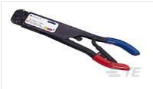
TE Part #69692-1 T-HEAD PIDG STRATO 26-20 ASSY