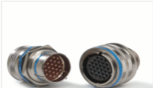
TE Part #ZPF00000000012475 DBAS 70-19-0 PN