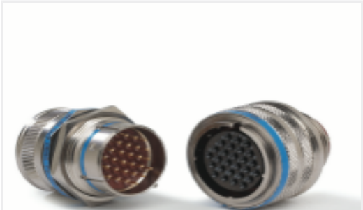
TE Part #ZPF00000000013798 DBAS 78-19-0 SN 059