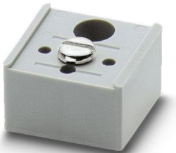
Support bracket, for insulated mounting of DIN rails in insulated systems, plastic, 21 mm high

Please be informed that the data shown in this PDF document is generated from our online catalog. Please find the complete data in the user documentation. Our general terms of use for downloads are valid.