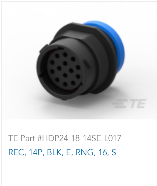
TE Part #HDP24-18-14SE-L017 REC, 14P, BLK, E, RNG, 16, S