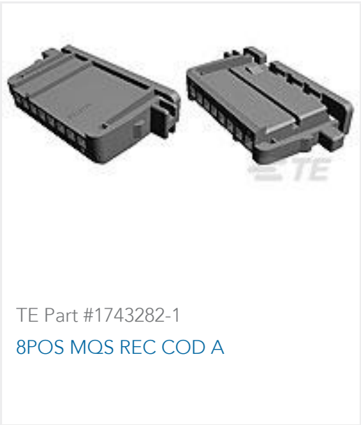
TE Part #1743282-1 8POS MQS REC COD A