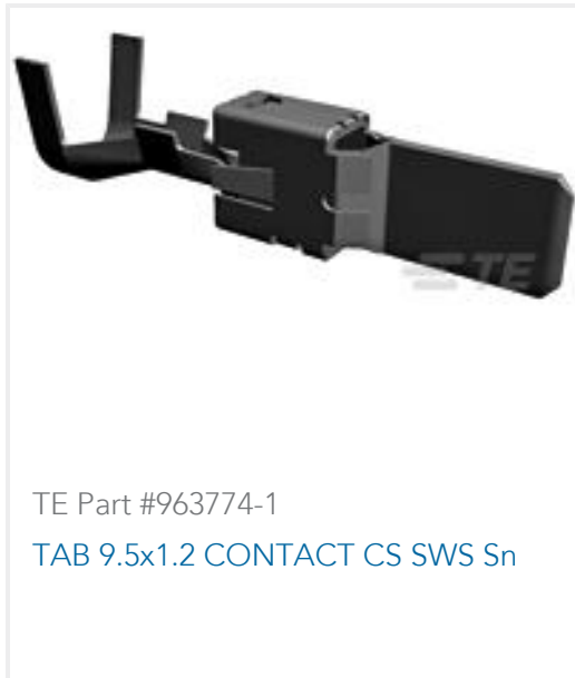
TE Part #963774-1 TAB 9.5x1.2 CONTACT CS SWS Sn