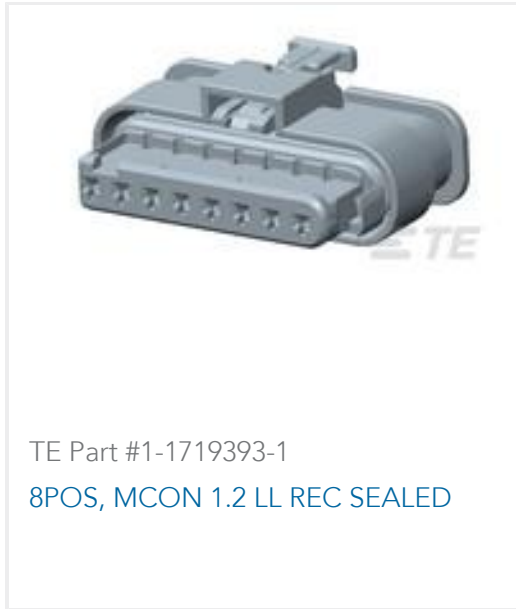
TE Part #1-1719393-1 8POS, MCON 1.2 LL REC SEALED