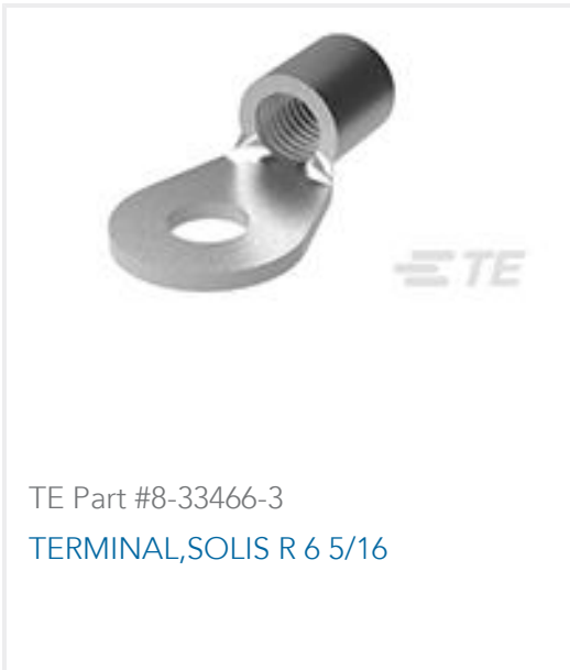
TE Part #8-33466-3 TERMINAL,SOLIS R 6 5/16