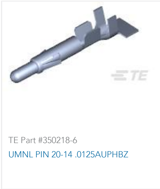
TE Part #350218-6 UMNL PIN 20-14 .0125AUPHBZ