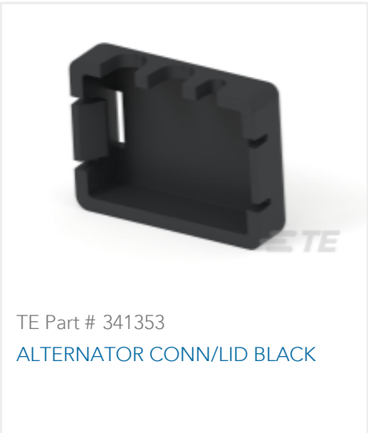
TE Part # 341353 ALTERNATOR CONN/LID BLACK