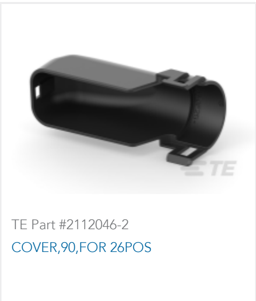
TE Part #2112046-2 COVER,90,FOR 26POS