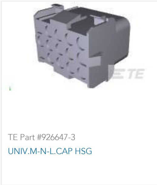
TE Part #926647-3 UNIV.M-N-L.CAP HSG