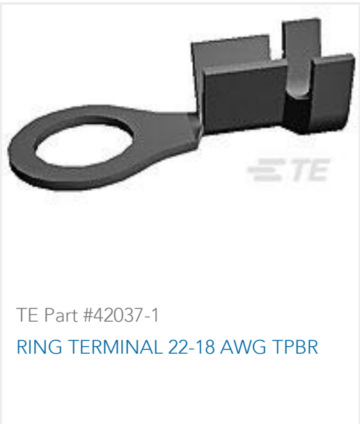
TE Part #42037-1 RING TERMINAL 22-18 AWG TPBR