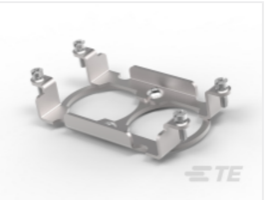
TE Part #T0924027845-000 H16BPR-2P-350-FRAME