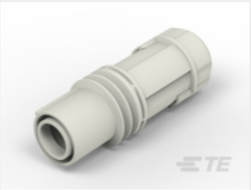
TE Part #T2193503201-000 HCM350-FC