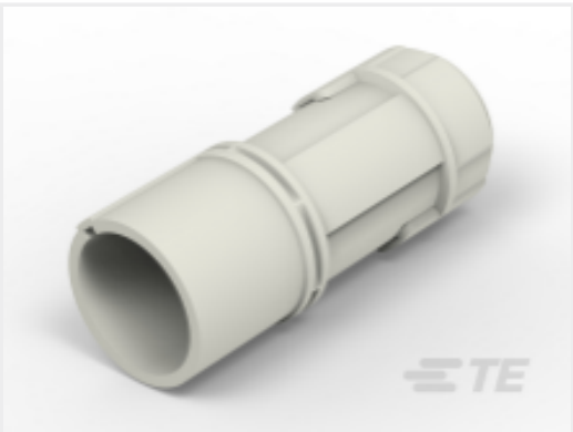
TE Part #T2193503101-000 HCM350-MC