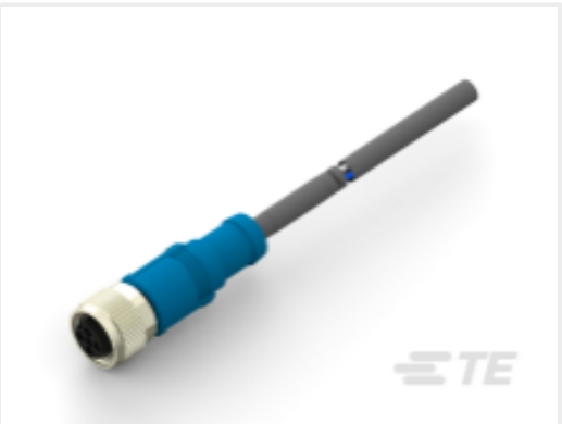
TE Part #T4151320005-001 RPC-M12-FS-5CON-PUR-0.5