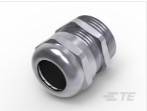
TE Part #T3707160101-000 DLX-16-MS (10~14)