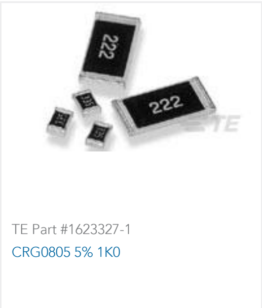
TE Part #1623327-1 CRG0805 5% 1K0