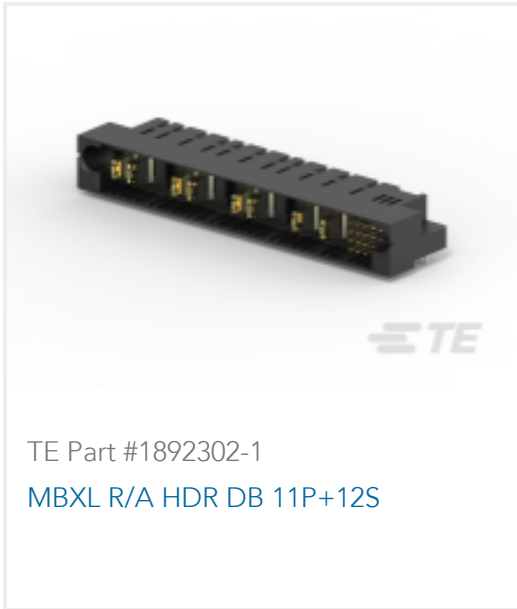
TE Part #1892302-1 MBXL R/A HDR DB 11P+12S