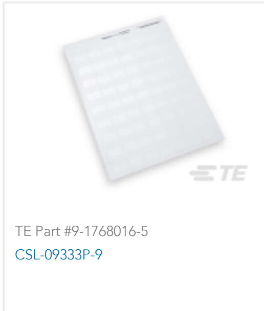
TE Part #9-1768016-5 CSL-09333P-9