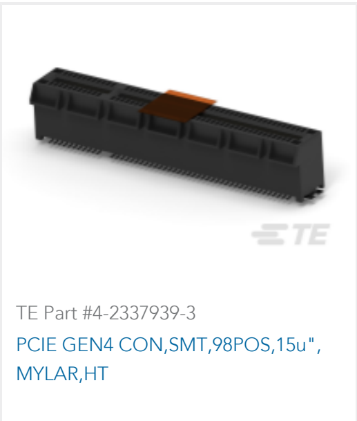
TE Part #4-2337939-3 PCIE GEN4 CON,SMT,98POS,15u", MYLAR,HT