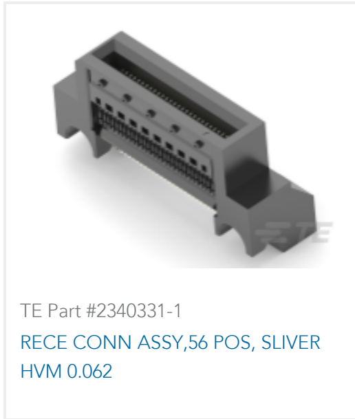
TE Part #2340331-1 RECE CONN ASSY,56 POS, SLIVER HVM 0.062