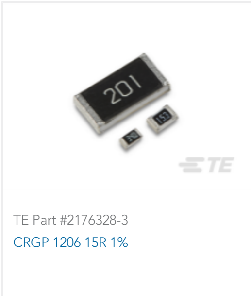
TE Part #2176328-3 CRGP 1206 15R 1%