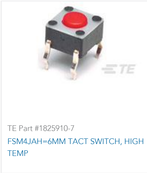
TE Part #1825910-7 FSM4JAH=6MM TACT SWITCH, HIGH TEMP