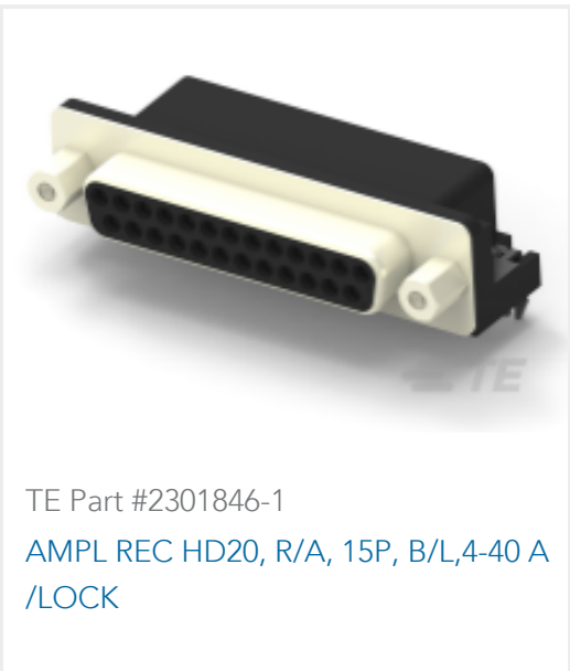
TE Part #2301846-1 AMPL REC HD20, R/A, 15P, B/L,4-40 A /LOCK