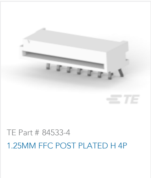
TE Part # 84533-4 1.25MM FFC POST PLATED H 4P