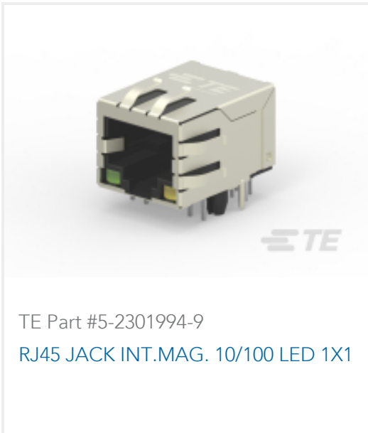
TE Part #5-2301994-9 RJ45 JACK INT.MAG. 10/100 LED 1X1