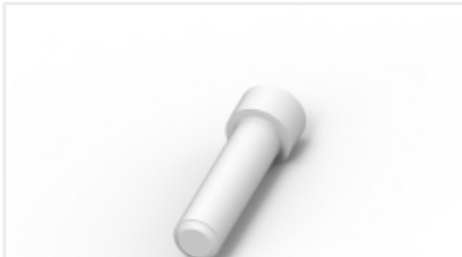
TE Part #114017-ZZ SEALING PLUG, SIZE 12/16, WHT