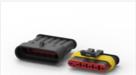
TE Part #CAT-AM71-CH8172 AMP SUPERSEAL 1.5MM, CONNECTOR HOUSING