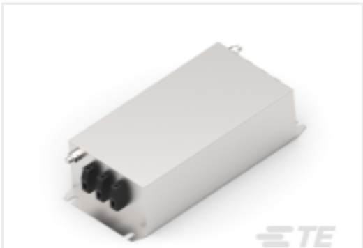
TE Part #5-1609967-0 KEM 60A 1S HIGH PER SP DELTA 520VAC