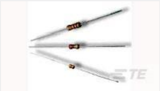
TE Part #1623927-4 CFR16 5% 10K