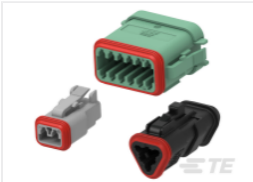
TE Part #CAT-J41-DDPC DEUTSCH DT Plug Connectors