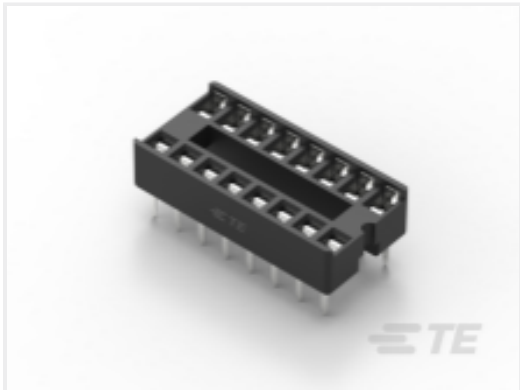
TE Part #CAT-D625-L52 DIP Socket: Low Profile, Stamped & Formed, Open, Tin