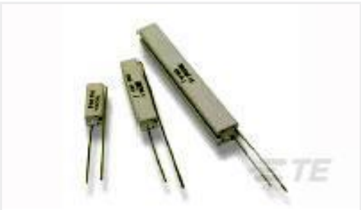
TE Part #1-1623728-3 BCHE 11 W 22R 5%