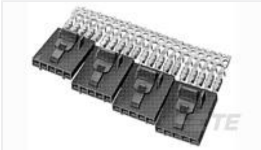
TE Part #5-103957-5 4X6 MTE RCPT SR LATCH .100CL