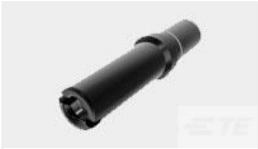
TE Part #1648384-1 708-73-01109=SA CONTACT,SKT