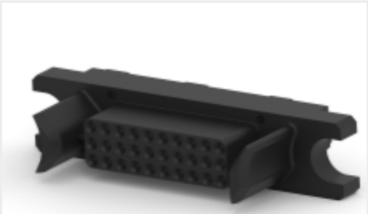
TE Part #6651205-1 CONN,SKT,POS30,MINI DRAWER