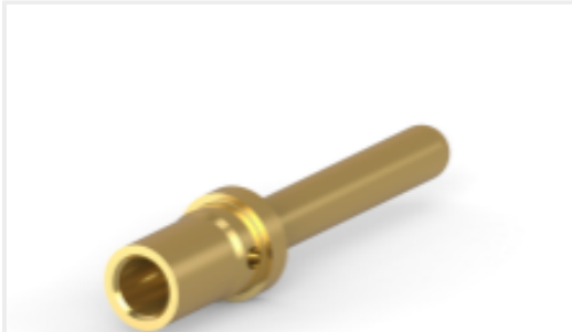
TE Part #1650156-2 701-15-02109=CONTACT,PIN,#12