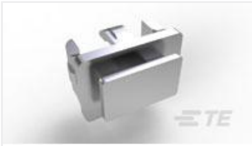
TE Part #1367147-3 SFP COVER, UNPL, NO LOGO