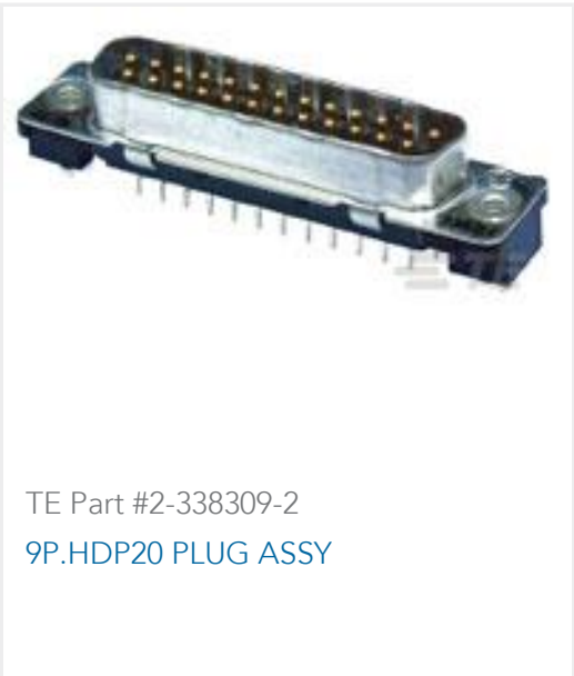
TE Part #2-338309-2 9P.HDP20 PLUG ASSY