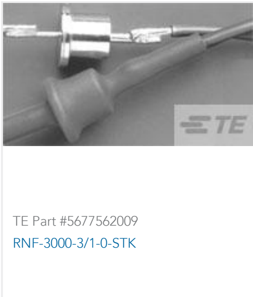
TE Part #5677562009 RNF-3000-3/1-0-STK