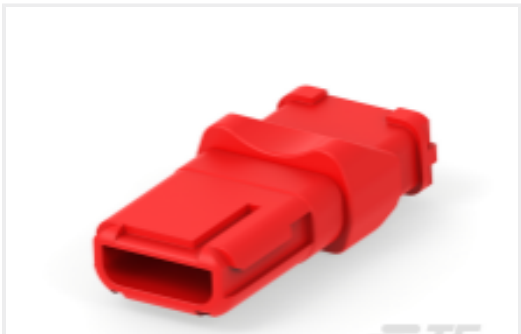
TE Part #CAT-D369-R33 Rectangular Connectors, 3 Way Receptacle