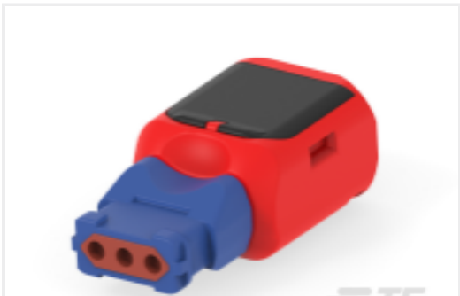
TE Part #CAT-D369-P33 Rectangular Connectors: 3-Way Plug