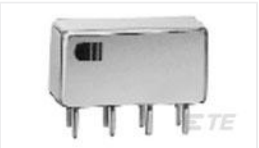
TE Part #1617037-7 HFW5A1201G00 = HFW 5AMP RELAY