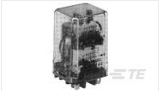
TE Part #2-1393115-6 KUL-11A15S-120=KU