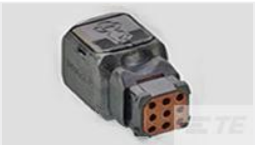
TE Part #D369-P99-NS1 369 9 WAY PLUG, CRIMP, SKT