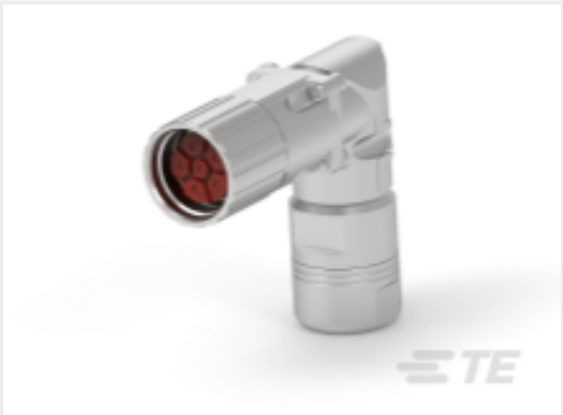
TE Part #BUA107N00580200000 923 PLUG, ANGLED