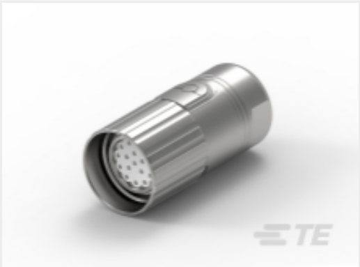
TE Part #ASA014N00410235000 623 PLUG