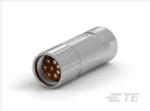
TE Part #BSA078N00420235000 923 PLUG