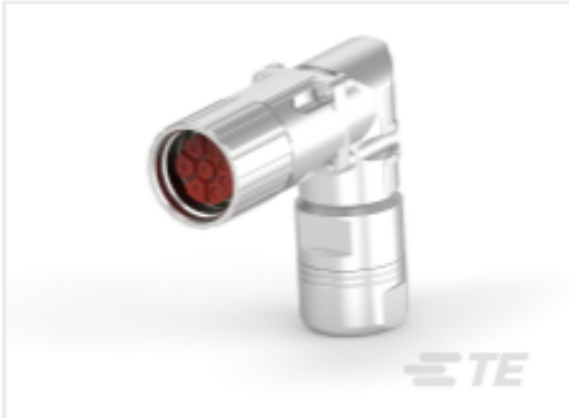
TE Part #BUA108N00420200000 923 PLUG, ANGLED