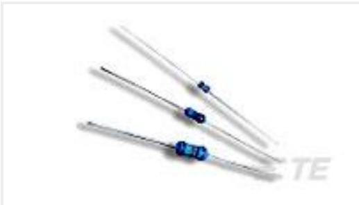
TE Part #8-1879026-6 YR1 0.1% 47R5