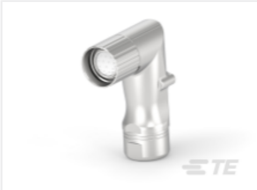
TE Part #AUA021N00550150000 623 PLUG, ANGLED