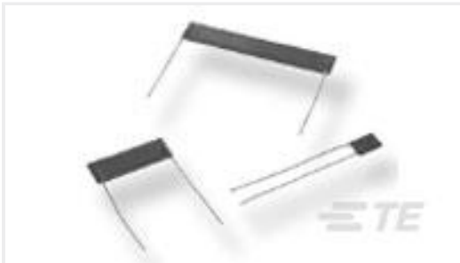
TE Part #2-1625959-5 HB03RE 50M 1% 100PPM