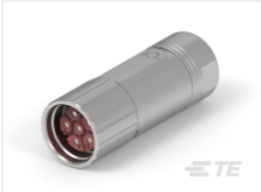
TE Part #BSA085N00480235000 923 PLUG