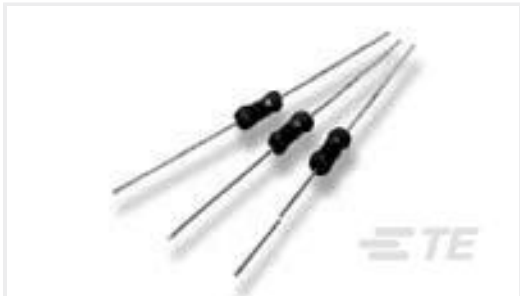
TE Part #2-1625886-0 1W SM M/OX 5% 47R