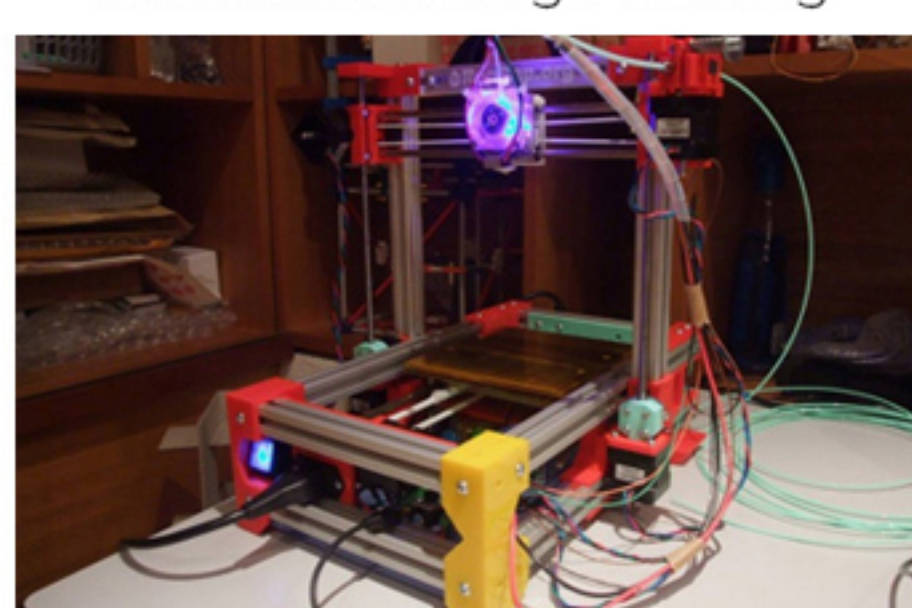
3D printer and thermal transfer use

▲ Suitable for electronic circuit board wave soldering shielded to protect the gold fingers and high-end electrical insulation, motor insulation, and lithium battery positive and negative ears fixed.