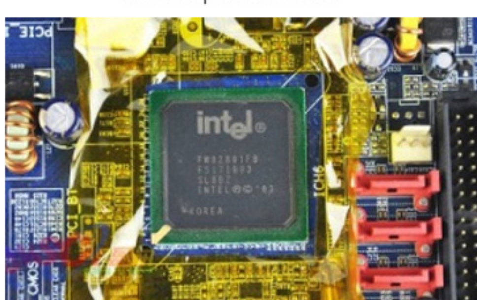
SMT high temperature protection