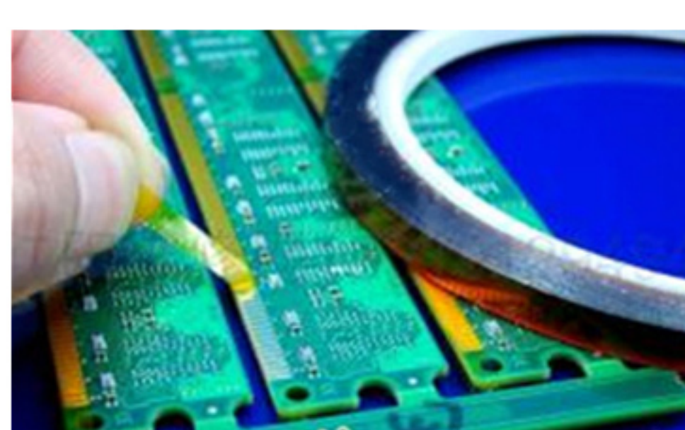
PCB board tin furnace oven protection