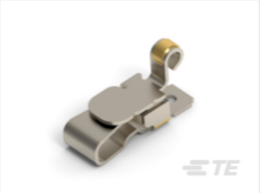
TE Part # 1551572-5 Shield Finger, Loose Piece