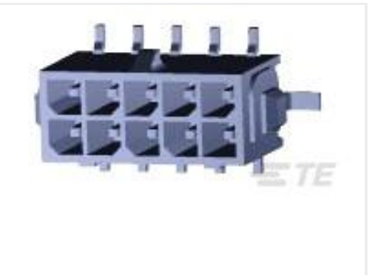
TE Part #4-794636-0 10P MICRO MNL ASSY,VRT,SMT,LF