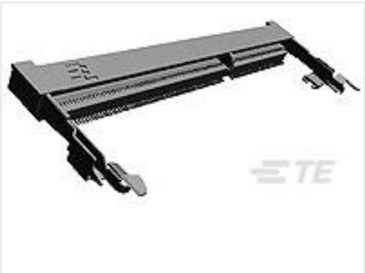
TE Part #2-2013310-2 EMBOSS TAPE DDR3 204P 9.2H STD