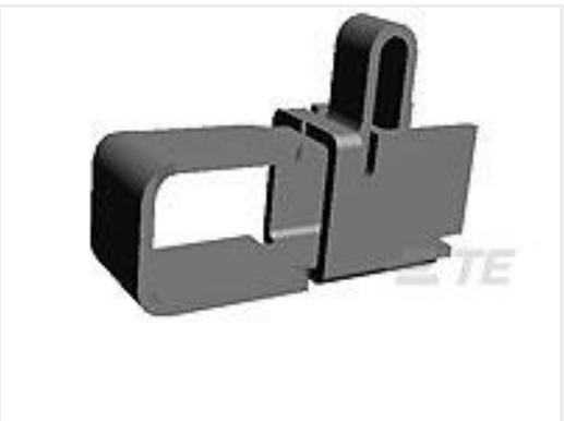
TE Part #1827625-1 SHIELD FINGER 3014 ANTI OVER STRESS TYPE