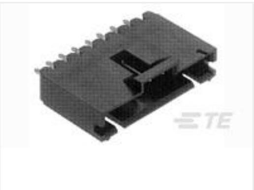
TE Part #5-103908-2 03 MTE HDR SRST LATCH W/HLDWN