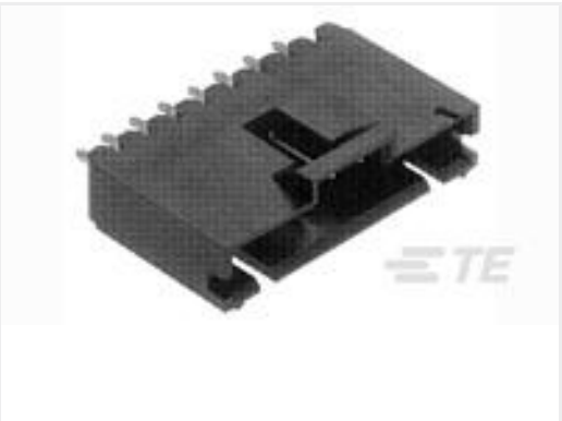
TE Part #5-103908-3 04 MTE HDR SRST LATCH W/HLDWN