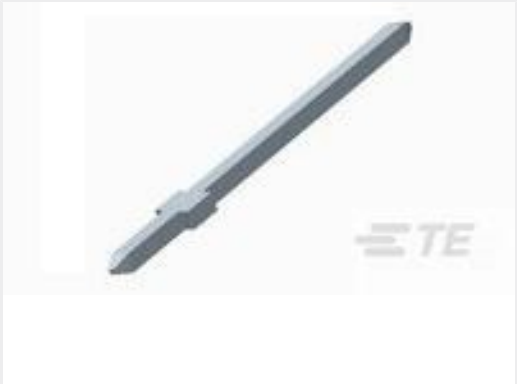
TE Part #2-928776-3 MOD2 STIFT M A-PIN