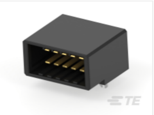
TE Part #CAT-D9934-A75E Header Assembly: Wire-to-Board, 15A, gold or tin plated