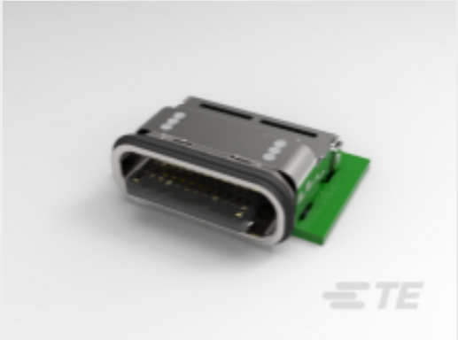
TE Part # 2305018-2 USB TYPE C, REC IPX8 ON BOARD DUAL SMT