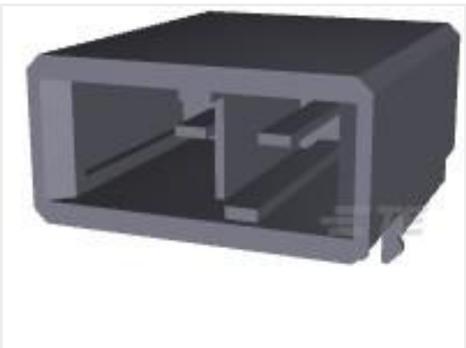
TE Part #1-179276-2 DYNAMIC 3200 HDR ASSY 2P H