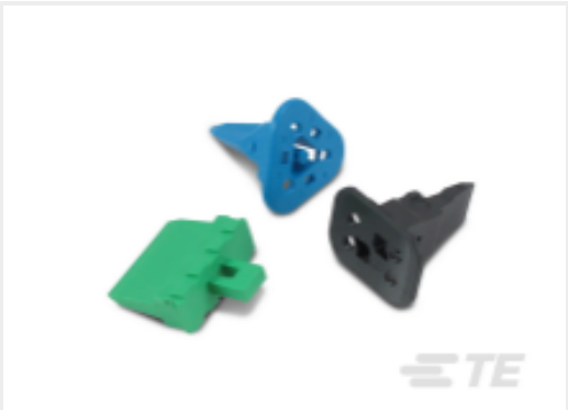
TE Part #CAT-D487-W416 Wedgelocks: DEUTSCH DT