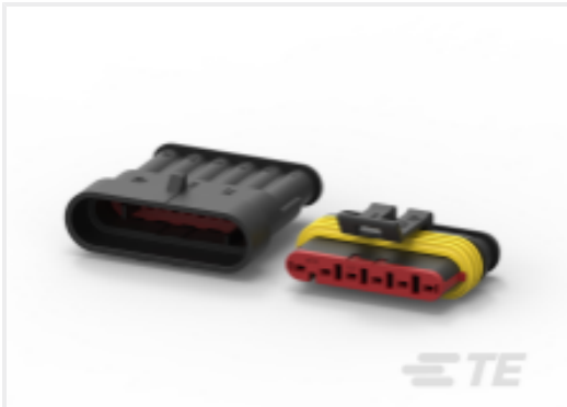
TE Part #CAT-AM71-CH8172 AMP SUPERSEAL 1.5MM, CONNECTOR HOUSING