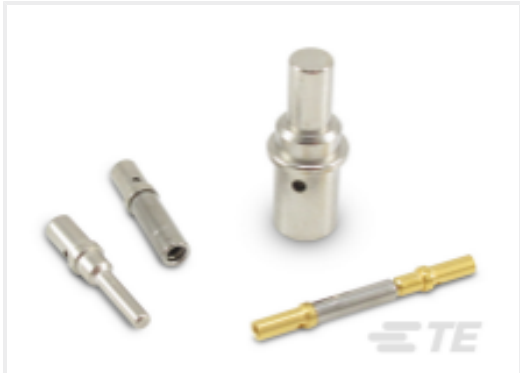
TE Part #CAT-D48-ST273 DEUTSCH Solid Contacts