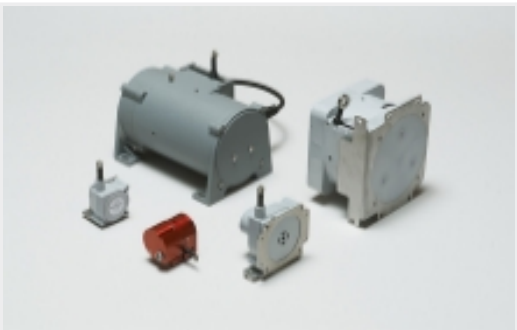
Cable Actuated Position Sensors(10)