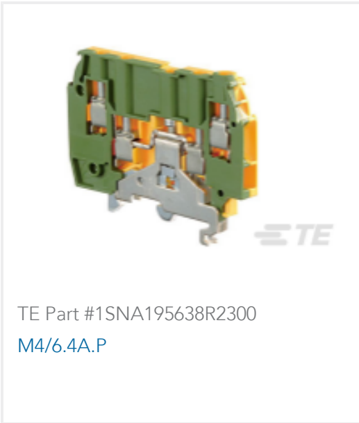
TE Part #1SNA195638R2300 M4/6.4A.P