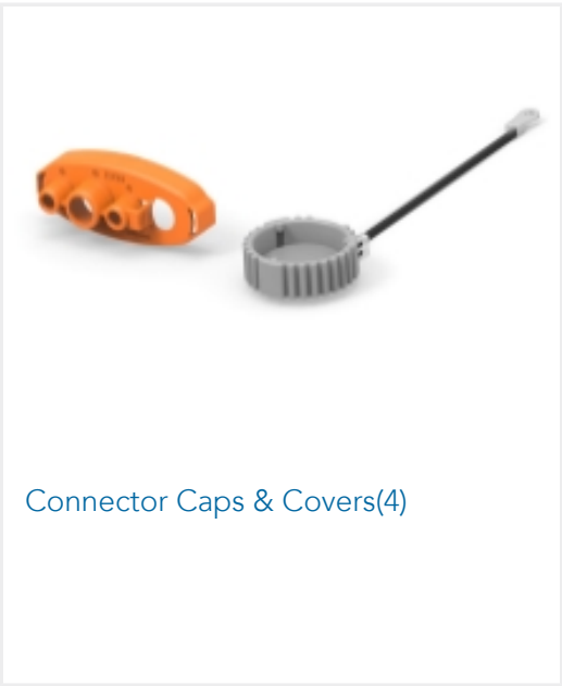
Connector Caps & Covers(4)