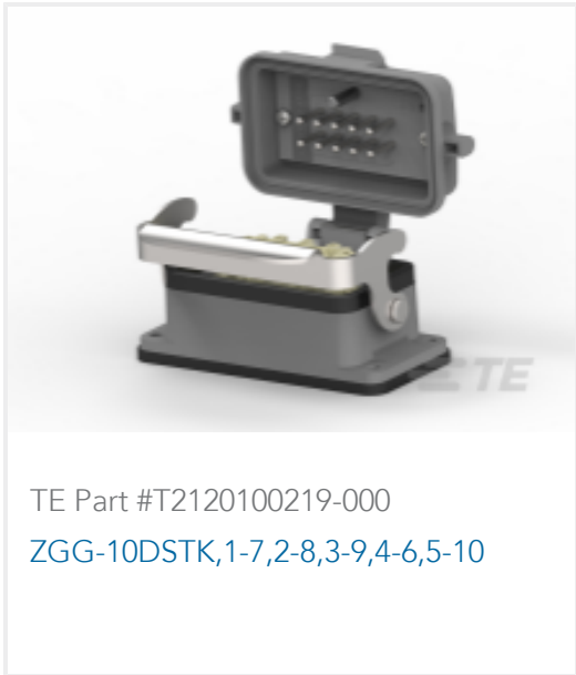
TE Part #T2120100219-000 ZGG-10DSTK,1-7,2-8,3-9,4-6,5-10