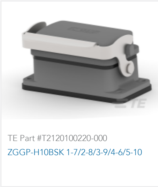
TE Part #T2120100220-000 ZGGP-H10BSK 1-7/2-8/3-9/4-6/5-10