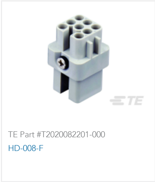
TE Part #T2020082201-000 HD-008-F