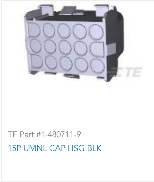
TE Part #1-480711-9 15P UMNL CAP HSG BLK