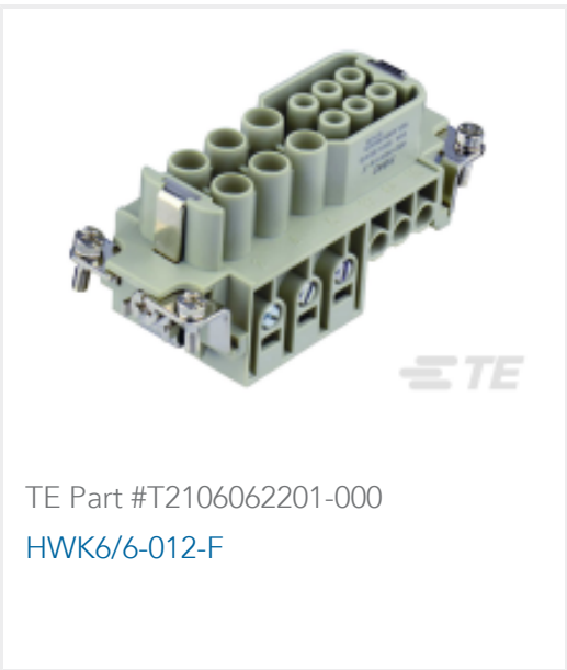
TE Part #T2106062201-000 HWK6/6-012-F