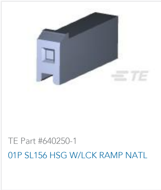
TE Part #640250-1 01P SL156 HSG W/LCK RAMP NATL