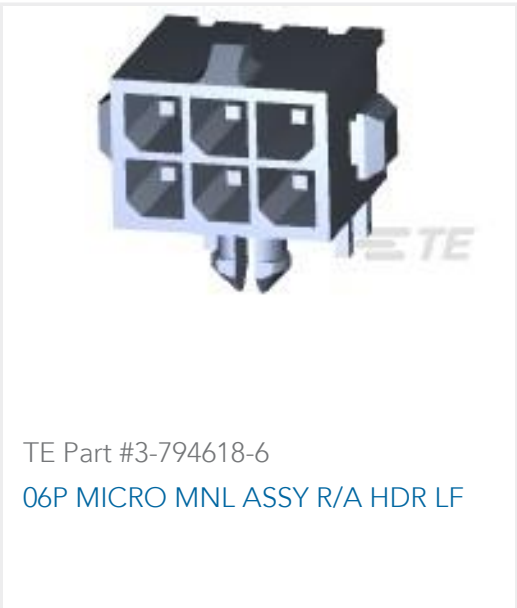
TE Part #3-794618-6 06P MICRO MNL ASSY R/A HDR LF