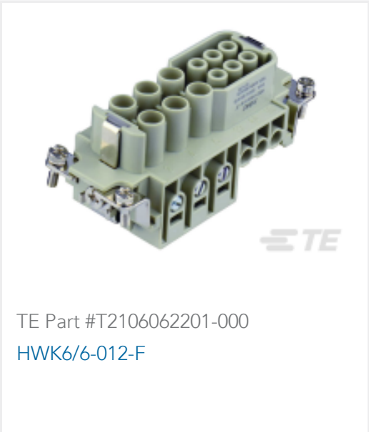
TE Part #T2106062201-000 HWK6/6-012-F