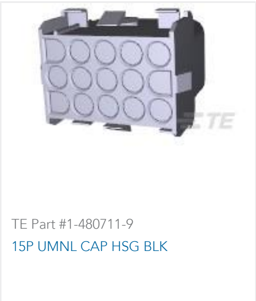
TE Part #1-480711-9 15P UMNL CAP HSG BLK