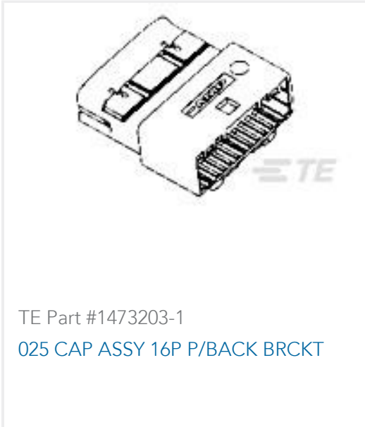
TE Part #1473203-1 025 CAP ASSY 16P P/BACK BRCKT