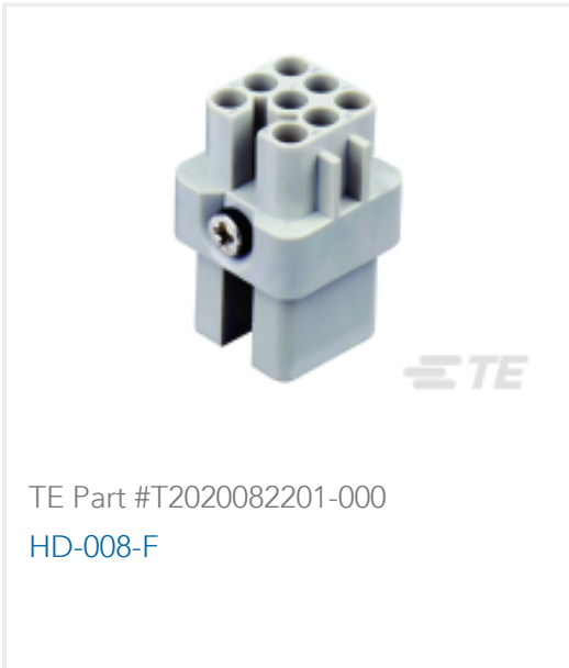
TE Part #T2020082201-000 HD-008-F