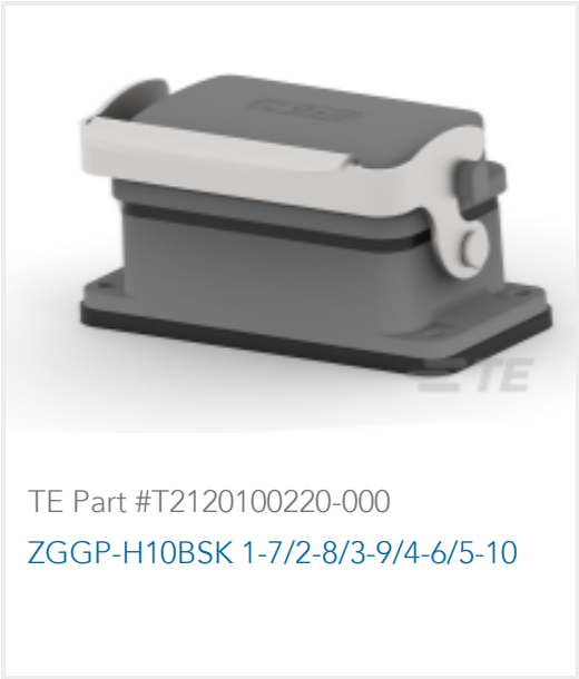
TE Part #T2120100220-000 ZGGP-H10BSK 1-7/2-8/3-9/4-6/5-10