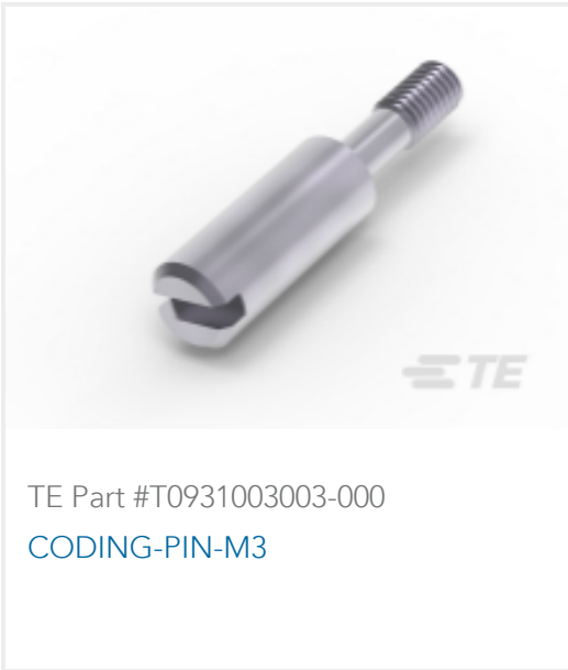
TE Part #T0931003003-000 CODING-PIN-M3