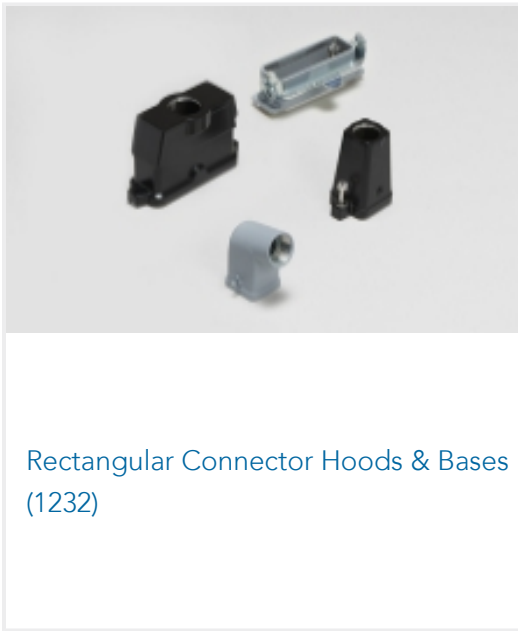
Rectangular Connector Hoods & Bases (1232)