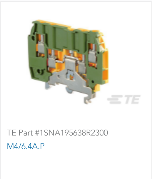
TE Part #1SNA195638R2300 M4/6.4A.P