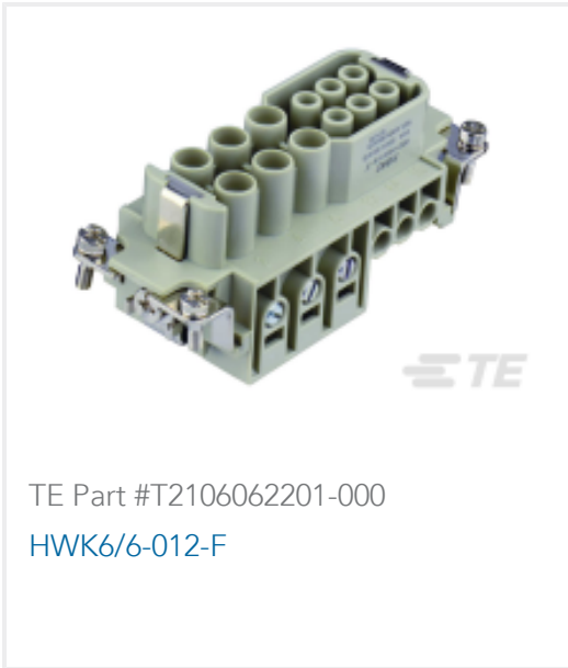
TE Part #T2106062201-000 HWK6/6-012-F