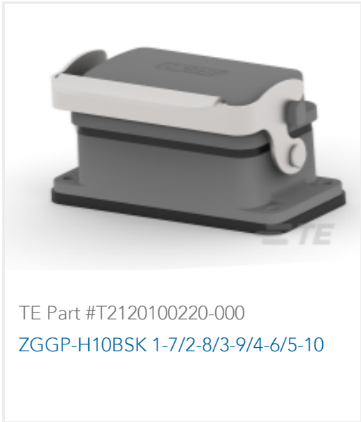
TE Part #T2120100220-000 ZGGP-H10BSK 1-7/2-8/3-9/4-6/5-10