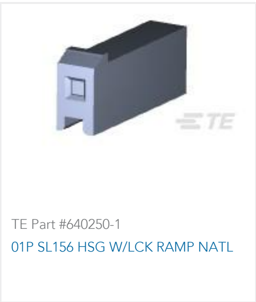
TE Part #640250-1 01P SL156 HSG W/LCK RAMP NATL