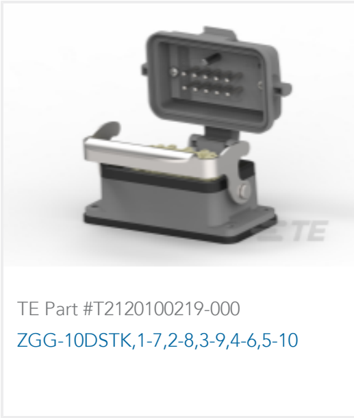
TE Part #T2120100219-000 ZGG-10DSTK,1-7,2-8,3-9,4-6,5-10