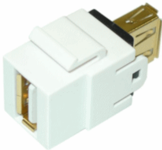
Minimum Connection Depth