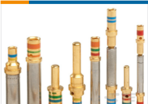
TE Part # ZPF000000000003591 724-0001-16