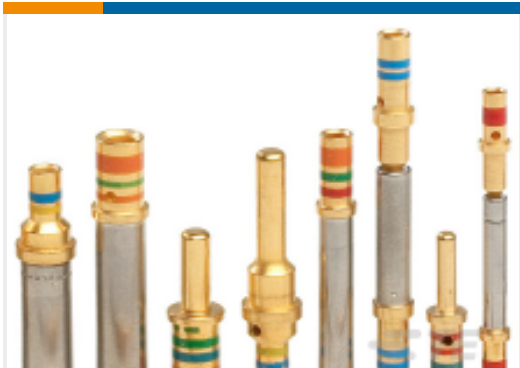
TE Part # ZPF000000000003592 724-0001-20