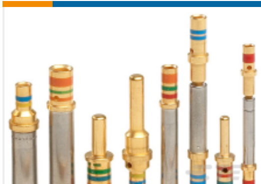
TE Part # ZPF000000000003599 724-0003-22