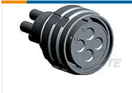
TE Part #1811902-1 ASY, PLUG, SIZE 19, FREE HANGING, N KEY