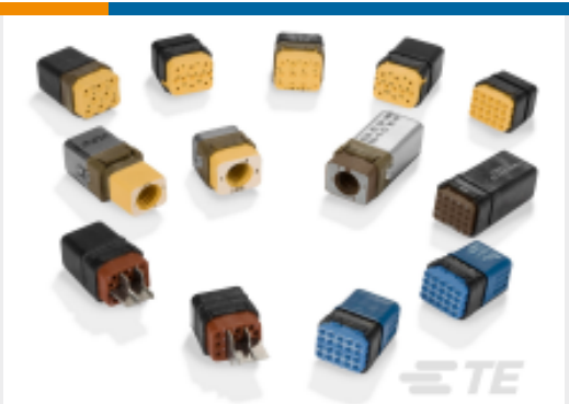
TE Part # ZPF0000000000015318 DMC-M 20-22 SN