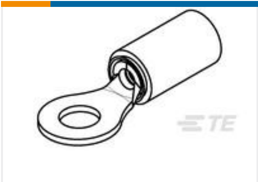
TE Part #1577639-1 TERMINAL RT PIDG PEEK STRATO 14-12 AWG