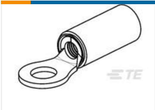
TE Part #1577647-1 TERMINAL RT PIDG PEEK STRATO 10 AWG