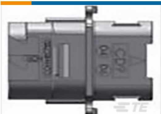
TE Part # ZPF0000000000146191 DMC-MD 26 B-K-T