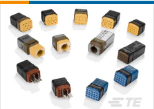
TE Part # ZPF0000000000015306 DMC-M 20-22 PN