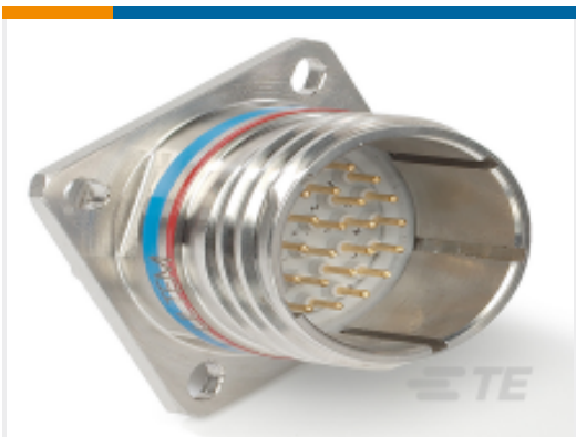
TE Part #YDTS20Z17- 35AAV001 RECP ASSY