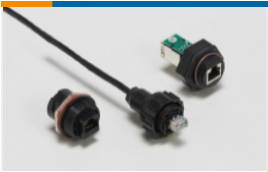
Circular RJ45 Connectors (22)