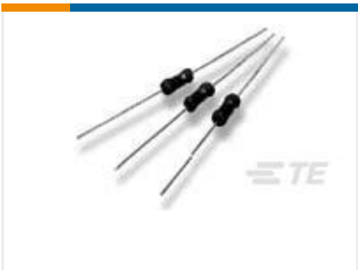
TE Part #5-1879350-8 RR01 5% 51R AMMO