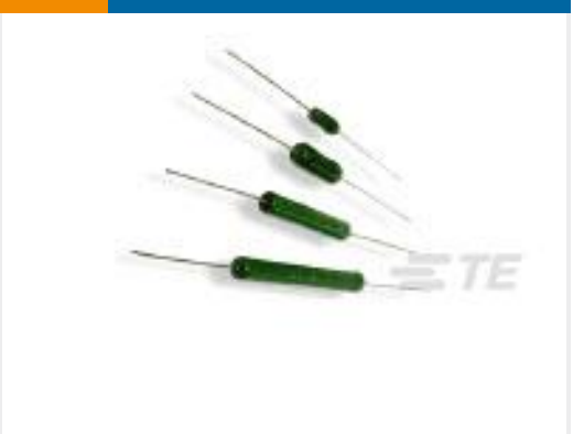
TE Part #1623771-3 C3A 10K 5% AMMO PK