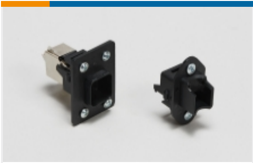
Circular Ethernet Hardware (2)