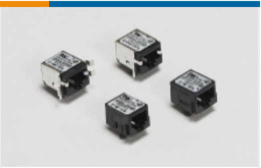
Modular Jack Filters(1)