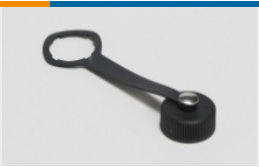
Modular Jack & Plug Caps & Covers(2)