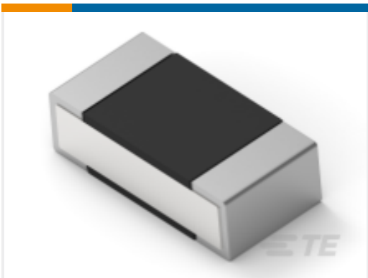
TE Part #2176311-5 RP 1E 0.1W 1K27 0.1% 25PPM 1K RL