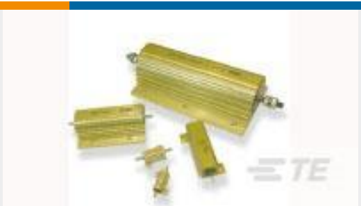
TE Part #3-1630186-5 HSA50 620R 5%