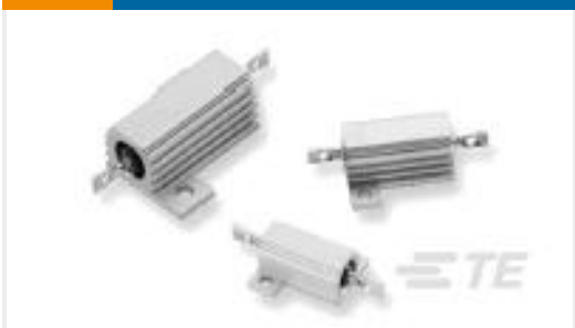
TE Part #5-1879075-6 THS25 22K 5%