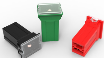
PAL Fuses - 2938 Series