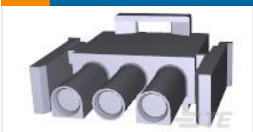
TE Part #350766-1 03P UMNL PLUG HSG