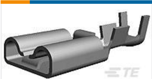
TE Part #175022-1 250 PL EX REC. 18-14AWG PTBR