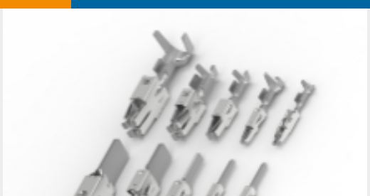
TE Part #962943-1 TIMER, RECEPTACLE AND TAB