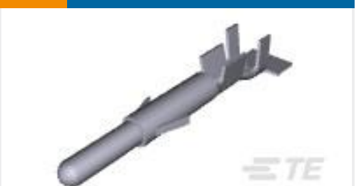
TE Part #350654-1 UMNL GRND PIN 20-14 PTPBR