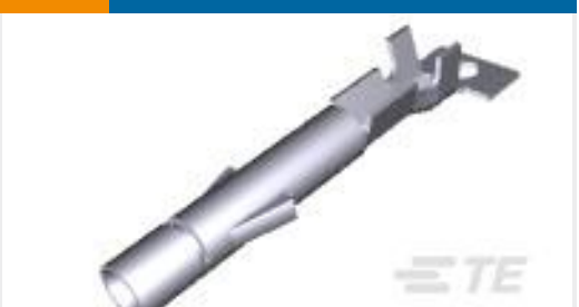
TE Part #926884-3 UNIV.M-M-L.SOCKET