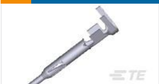
TE Part #170360-1 UNIV M-N-L PIN 22-18 AWG