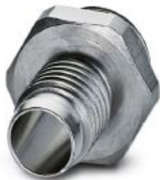
M8 pin, front mounting SMD with M10 screw fastening

Please be informed that the data shown in this PDF Document is generated from our Online Catalog. Please find the complete data in the user's documentation. Our General Terms of Use for Downloads are valid ( http://phoenixcontact.com/download )