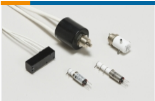
High Voltage Relays(18)