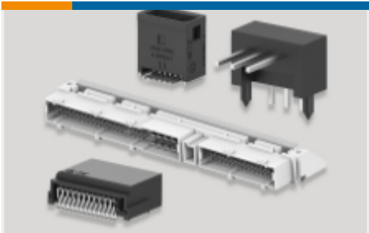
PCB Headers & Receptacles(10386)