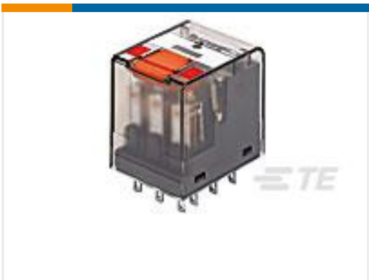
TE Part #3-1415020-1 PT570N20