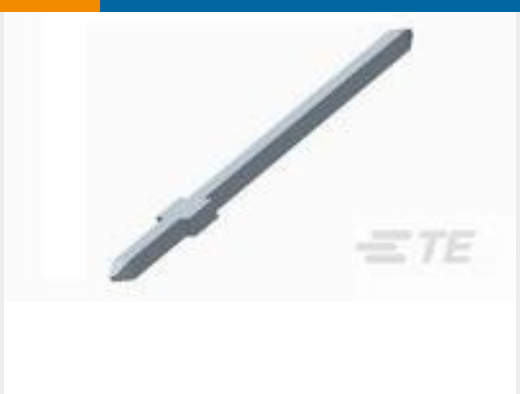
TE Part #1-928836-2 MOD2 PIN WITH A-PIN L/P