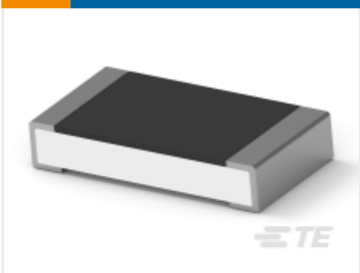
TE Part #4-2176391-7 RQ 1206 37K4 0.1% 10PPM 5K RL