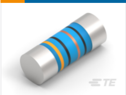
TE Part #2176314-4 MELF SMA_A 180R 0.1% 15PPM 0102 0.3W