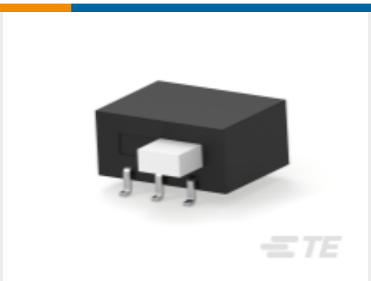
TE Part #1-1437581-1 ASE22RL=AUTOSLIDE DP