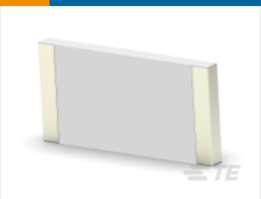
TE Part #7-2176246-6 CRGS2512 5% 1M8