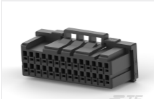
TE Part #1-2333134-3 DYNAMIC 1100D REC HSG X 26P BLACK 33%GF