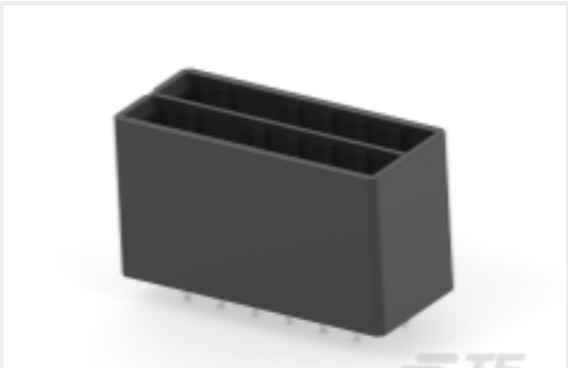
TE Part #CAT-D9934-A75F Header Assembly: Wire-to-Board, 15A, gold or tin plated