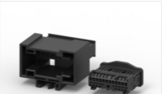
TE Part #CAT-M8793-CH8172 MQS, CONNECTOR HOUSING