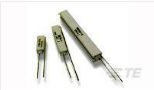
TE Part #3-1623732-0 BCHE 7 W 330R 5%