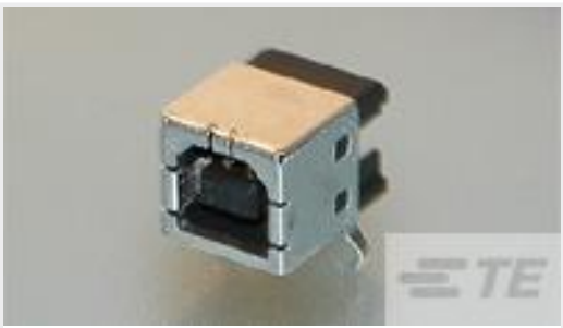
TE Part #292304-1 STD USB TYPE B, R/A, T/H