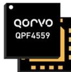
16 Pad 3 x 3 mm Laminate Package