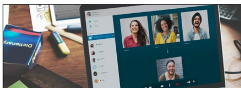
5G Networking/Telecommunications Communication Modules (WiFi Routers and Mesh Devices)