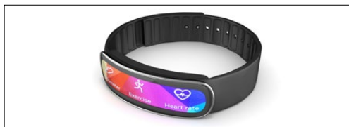
Wearables (Smart Watches, Health Monitors, AR & VR)