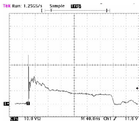
Figure 1. ESD Clamping Voltage Screenshot Positive 8 kV contact per IEC 61000-4-2