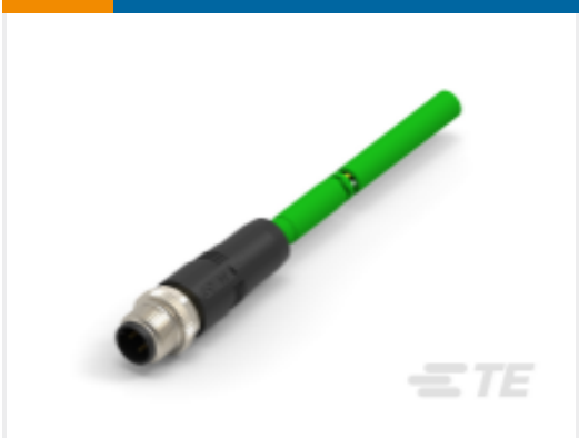
TE Part #TAD14145101-002 M12D4-MS-PUR TYPE C GREEN-1.0M