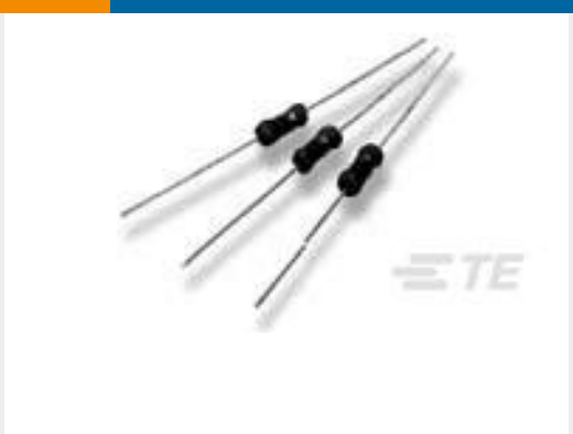
TE Part #1-1879355-9 RR03 5% 24K AMMO