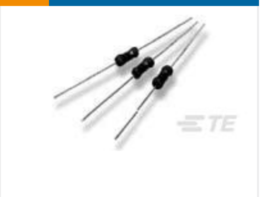
TE Part #2-1879355-5 RR03 5% 43K AMMO