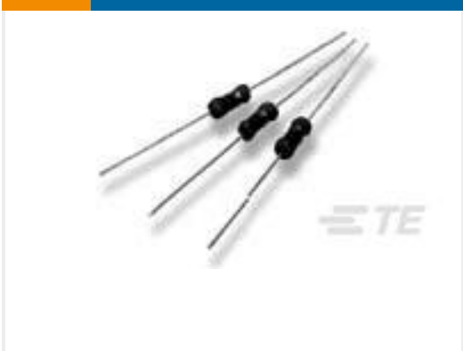
TE Part #2-1879355-7 RR03 5% 51K AMMO