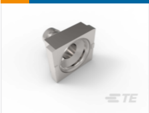
TE Part #1-2308348-4 Crimp Flange for Size 4-5 STD/5QL Shell