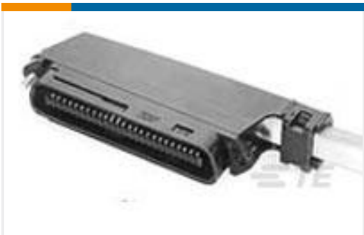
TE Part #5229912-1 KIT, PLUG, 50 POS,B SLOT C/LOK