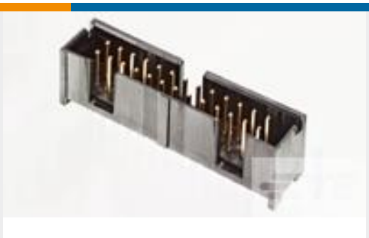
TE Part #1761681-3 IDC LOW PRO HDR 10P VERT HT BLACK