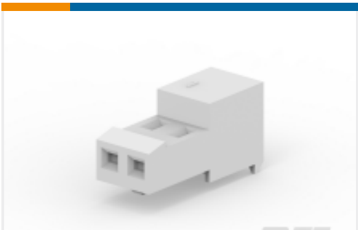
TE Part #3-640440-5 MTA Receptacle: Nylon, Tin Plated, 2.54 mm