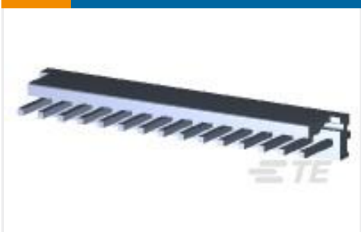
TE Part #1-640445-5 15P MTA156 HDR ASSY FL/STR SNL