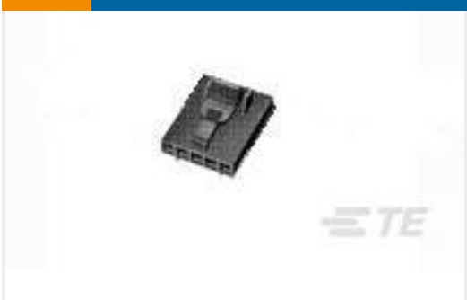
TE Part #104257-3 04 MTE RCPT HSG SR LATCH .100