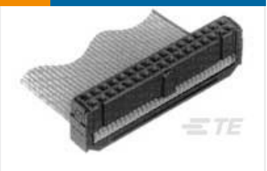
TE Part #1658622-1 10 NOVO MIL/CTR 30DP, LEAD FREE