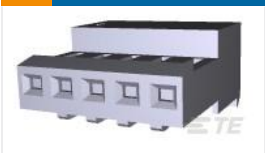
TE Part #3-640441-5 05P MTA100 CONN ASSY WHT