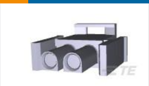
TE Part #350777-1 02P UMNL PLUG HSG