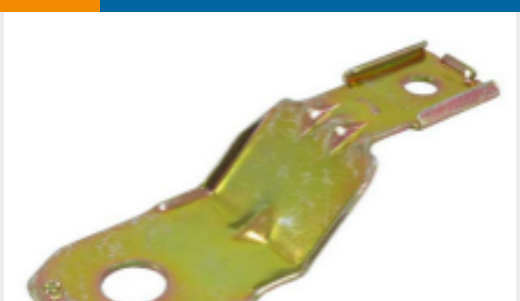
TE Part #1027-014-0800 CLIP, STEEL, ZINC, 8.2MM HOLE, ST, DT8PIN