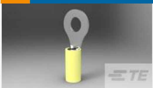
TE Part #35273 TERMINAL,PIDG R 12-10 1/4