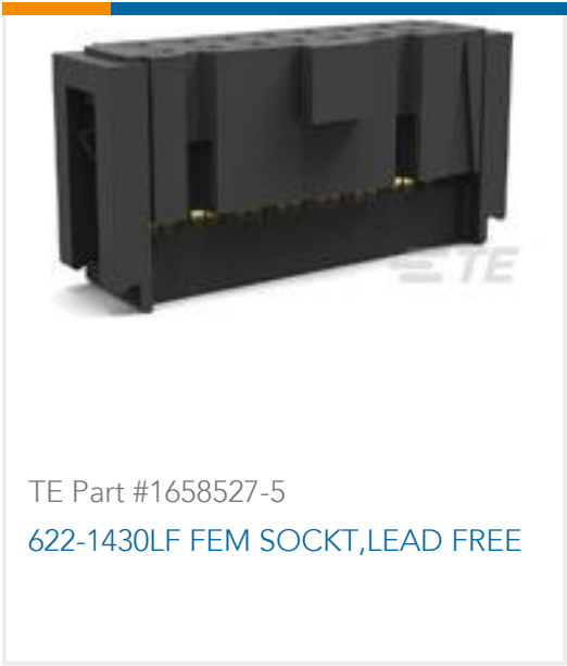
TE Part #1658527-5 622-1430LF FEM SOCKET, LEAD FREE