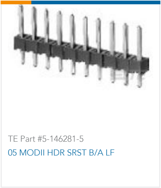
TE Part #5-146281-5 05 MOD II HDR SRST B/A LF