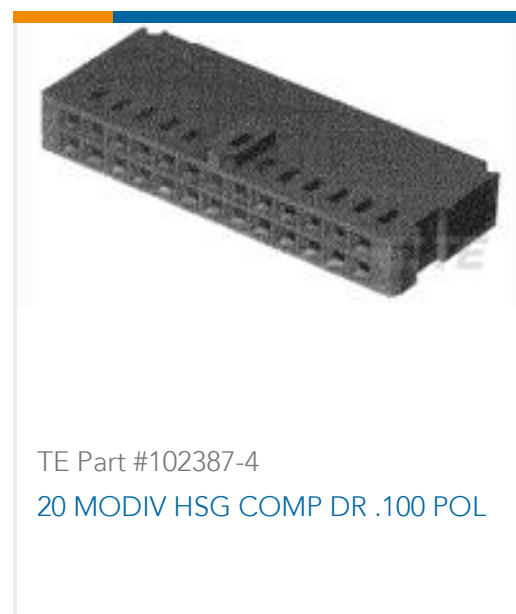
TE Part #102387-4 20 MODIV HSG COMP DR .100 POL