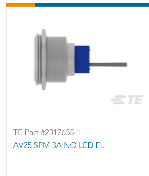
TE Part #2317655-1 AV25 SPM 3A NO LED FL