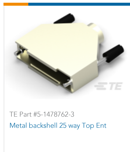
TE Part #5-1478762-3 Metal backshell 25 way Top Ent