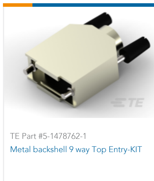
TE Part #5-1478762-1 Metal backshell 9 way Top Entry-KIT