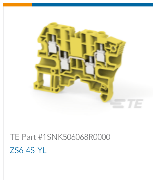
TE Part #1SNK506068R0000 ZS6-4S-YL