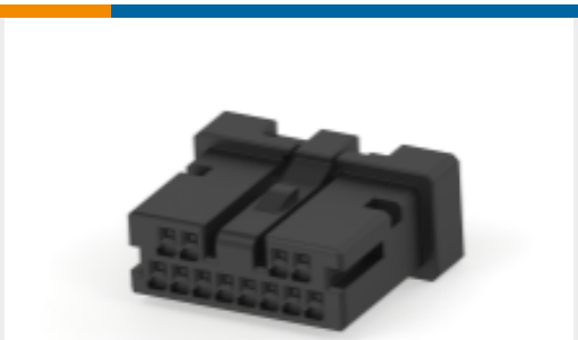
TE Part #1-2834461-2 Receptacle Housing Assembly