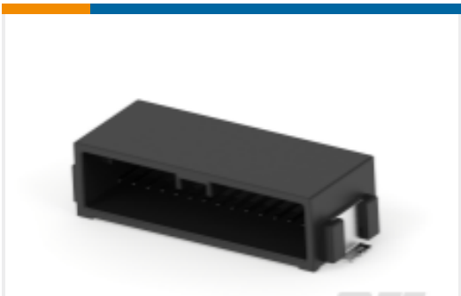
TE Part #2-2834465-4 MINI DYNAMIC HDR H 24P TIN X-KEY BLK