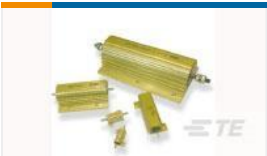
TE Part #5-1625971-4 HSA25 4R7 5%