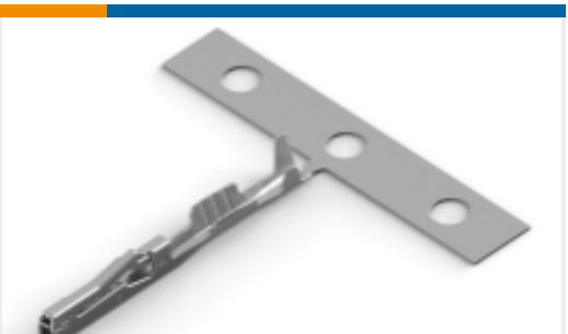
TE Part #2834464-6 MD REC CONT TIN 22/24 AWG