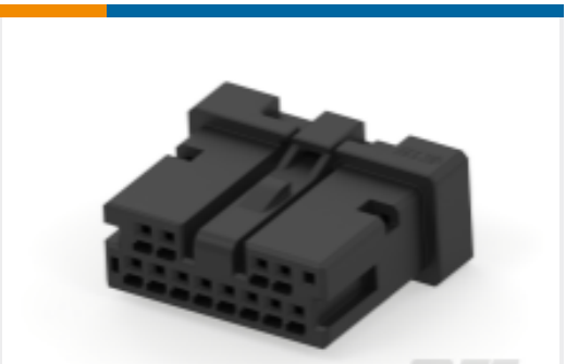
TE Part #1-2834497-2 MINI DYNAMIC REC HSG ASSY 12P Y-KEY BLK