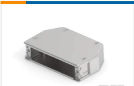
TE Part #1-2308338-1 QL-FULL METAL HOODS SIZE 5 (1 CABLE CLP)