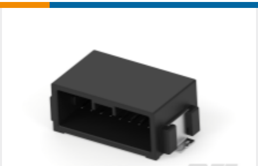
TE Part #1-2834499-2 MINI DYNAMIC HDR H 12P TIN Y-KEY BLK