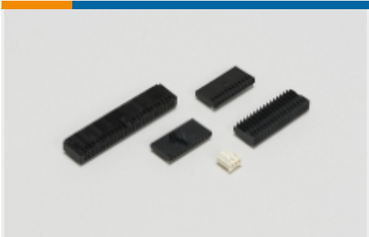
Wire-to-Board Connector Assemblies & Housings(5)