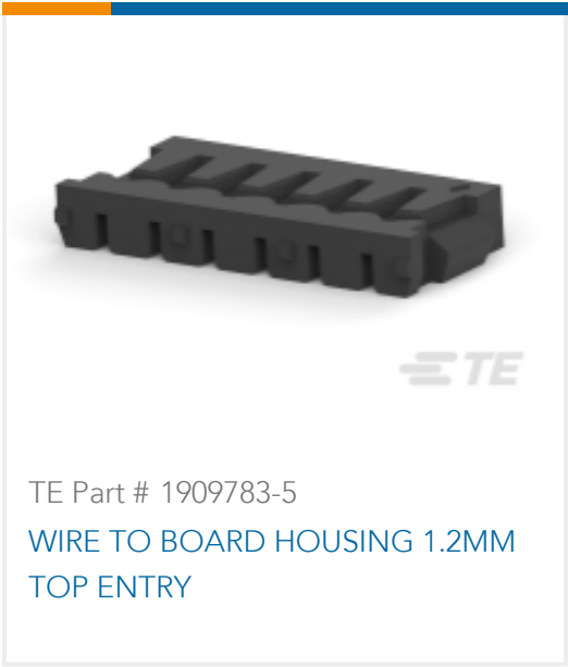
TE Part # 1909783-5 WIRE TO BOARD HOUSING 1.2MM TOP ENTRY