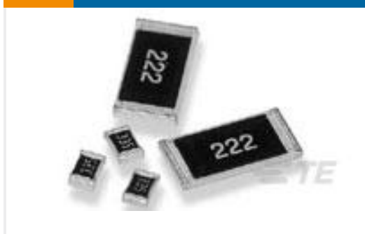
TE Part #1622838-1 CRG0603 1% 12K