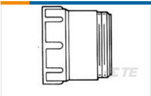
TE Part #207055-1 EXTENDER BACK SHELL