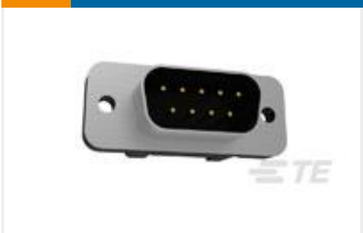
TE Part #1658608-4 09 POS HDF PLUG, MS, LEAD FREE