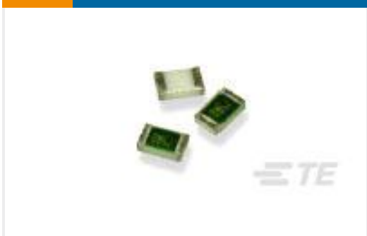
TE Part #3-1879216-0 CPF0402 120K 0.1% 25PPM 1K RL