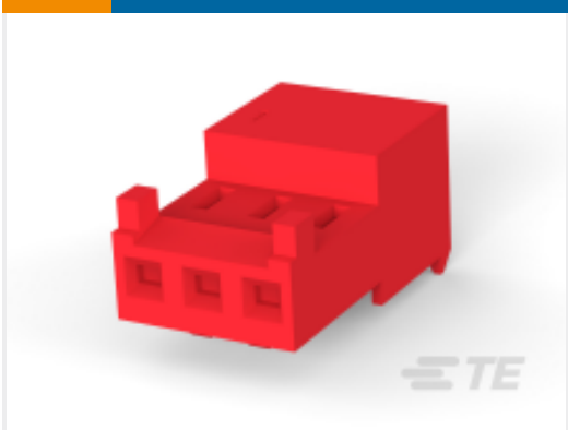
TE Part #4-643814-5 Nylon Tin Plated Receptacle: 2.54 mm, with Mating Alignment, MTA 100