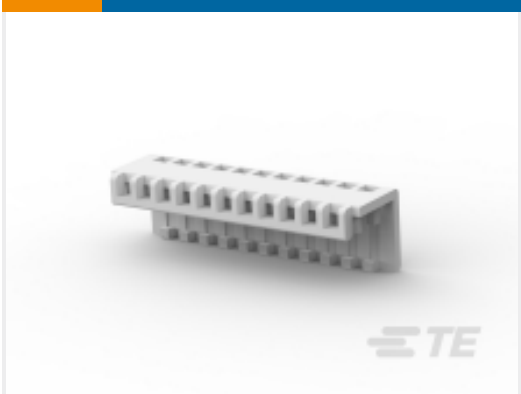
TE Part #643075-4 Nylon PCB Connector Covers: 2.54 mm, MTA 100