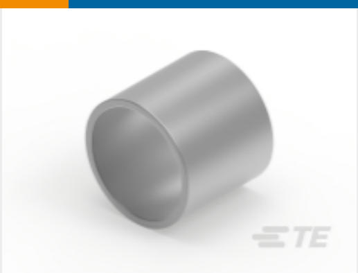
TE Part #1-2308350-5 CRIMP BARRELS