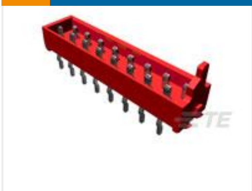
TE Part #215464-8 08P.MICRO-MATCH MOB