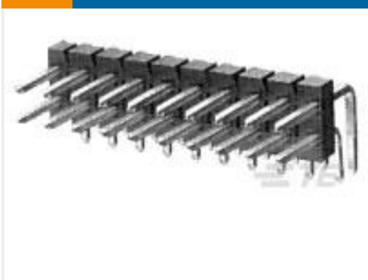
TE Part #826634-4 AMPMODU MOD II PIN HEADER