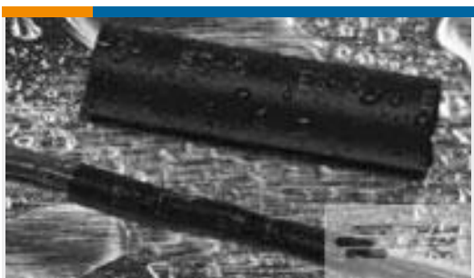
TE Part #EG9829-000 ES2000-NO.2-B9-0-127MM