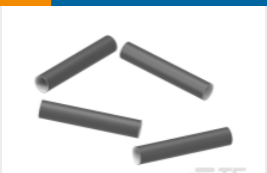
TE Part #926845P006 FL2500 Heat shrink Tubing