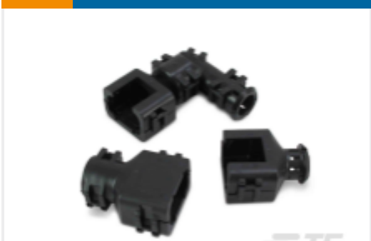
TE Part #2035366-1 AMPSEAL 16 Connectors Backshell