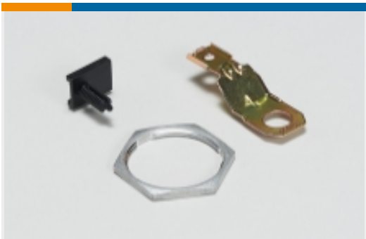
Other Automotive Connector Accessories(11)