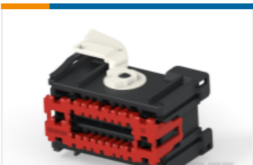
TE Part #2138731-2 36P UNSEALED HYBRID PLUG ASSEM