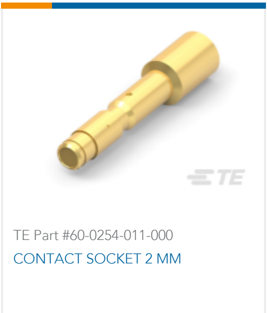
TE Part #60-0254-011-000 CONTACT SOCKET 2 MM