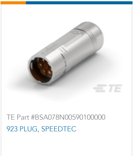
TE Part #BSA078N00590100000 923 PLUG, SPEEDTEC