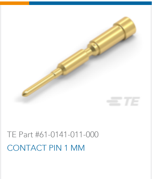
TE Part #61-0141-011-000 CONTACT PIN 1 MM