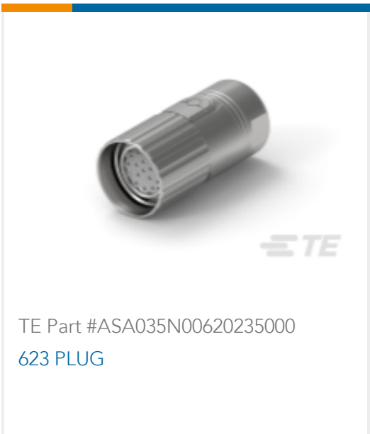
TE Part #ASA035N00620235000 623 PLUG