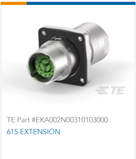
TE Part #EKA002N00310103000 615 EXTENSION