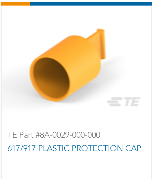
TE Part #8A-0029-000-000 617/917 PLASTIC PROTECTION CAP