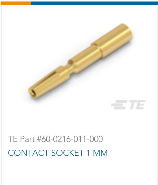
TE Part #60-0216-011-000 CONTACT SOCKET 1 MM