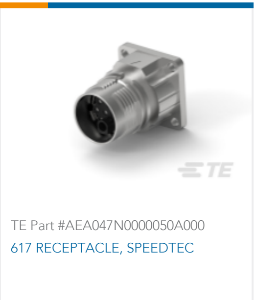
TE Part #AEA047N0000050A000 617 RECEPTACLE, SPEEDTEC