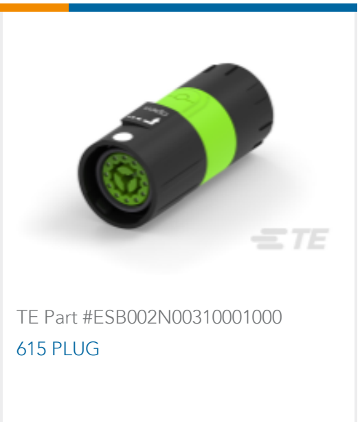
TE Part #ESB002N00310001000 615 PLUG