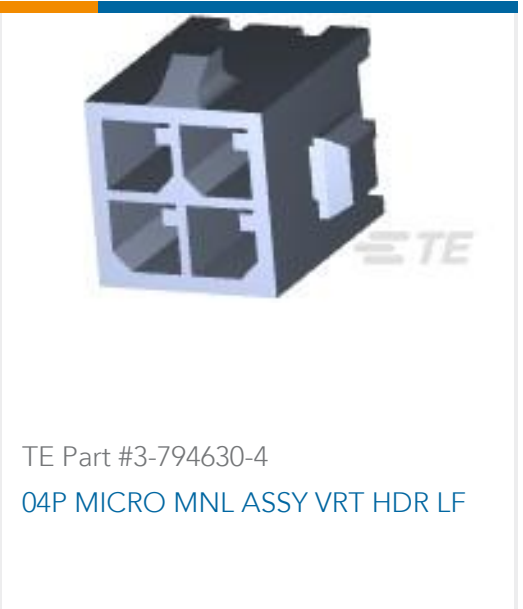
TE Part #3-794630-4 04P MICRO MNL ASSY VRT HDR LF