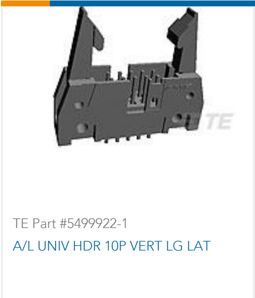
TE Part #5499922-1 A/L UNIV HDR 10P VERT LG LAT