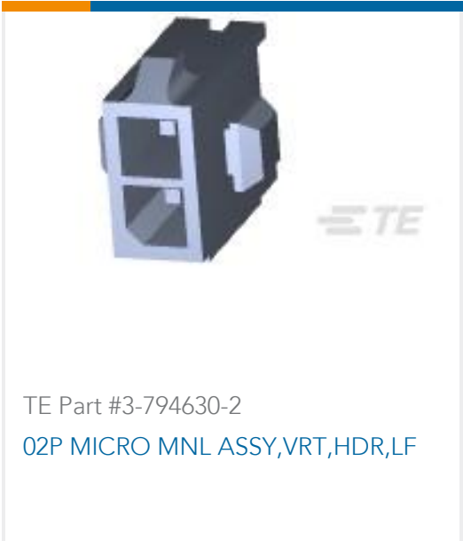
TE Part #3-794630-2 02P MICRO MNL ASSY,VRT,HDR,LF