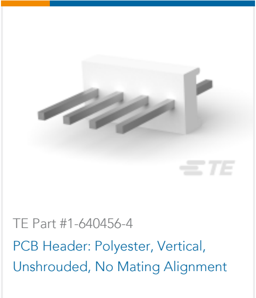
TE Part #1-640456-4 PCB Header: Polyester, Vertical, Unshrouded, No Mating Alignment