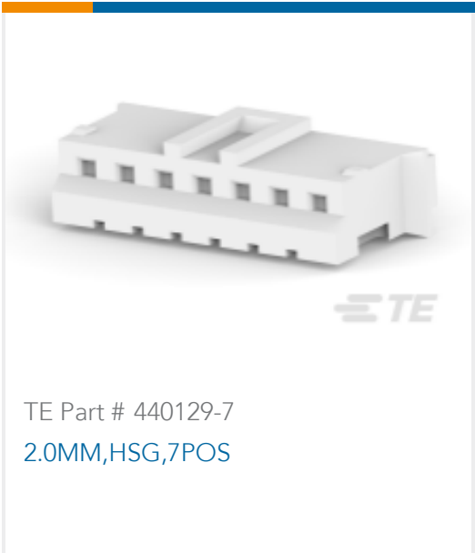
TE Part # 440129-7 2.0MM,HSG,7POS