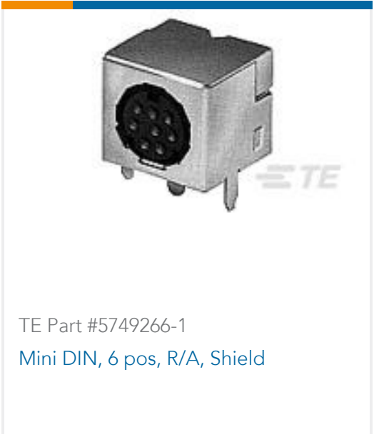
TE Part #5749266-1 Mini DIN, 6 pos, R/A, Shield