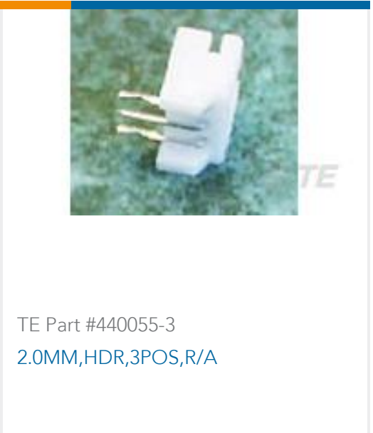
TE Part #440055-3 2.0MM,HDR,3POS,R/A