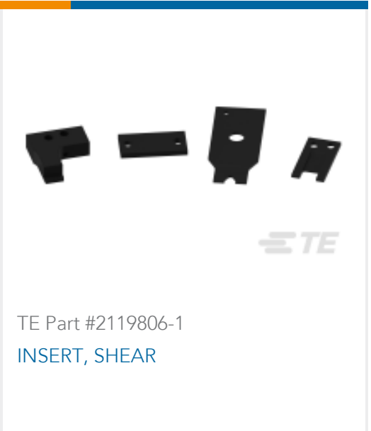
TE Part #2119806-1 INSERT, SHEAR