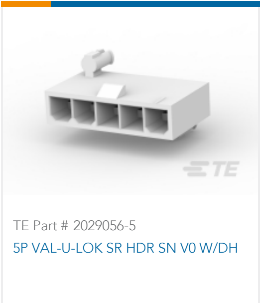
TE Part # 2029056-5 5P VAL-U-LOK SR HDR SN V0 W/DH