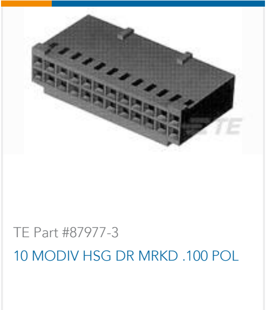
TE Part #87977-3 10 MODIV HSG DR MRKD .100 POL