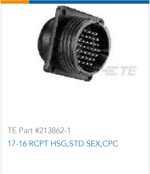
TE Part #213862-1 17-16 RCPT HSG,STD SEX,CPC