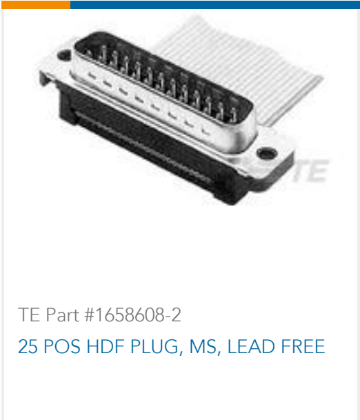
TE Part #1658608-2 25 POS HDF PLUG, MS, LEAD FREE