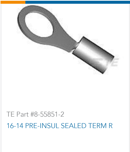
TE Part #8-55851-2 16-14 PRE-INSUL SEALED TERM R