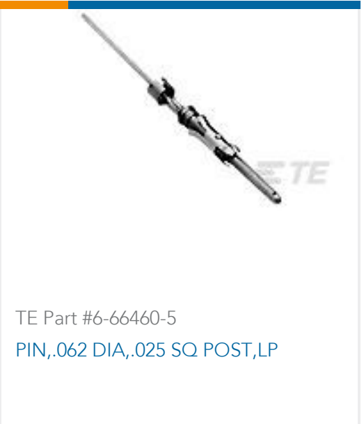
TE Part #6-66460-5 PIN,.062 DIA,.025 SQ POST,LP