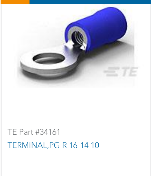
TE Part #34161 TERMINAL,PG R 16-14 10