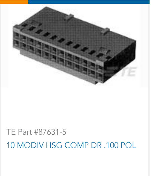
TE Part #87631-5 10 MODIV HSG COMP DR .100 POL