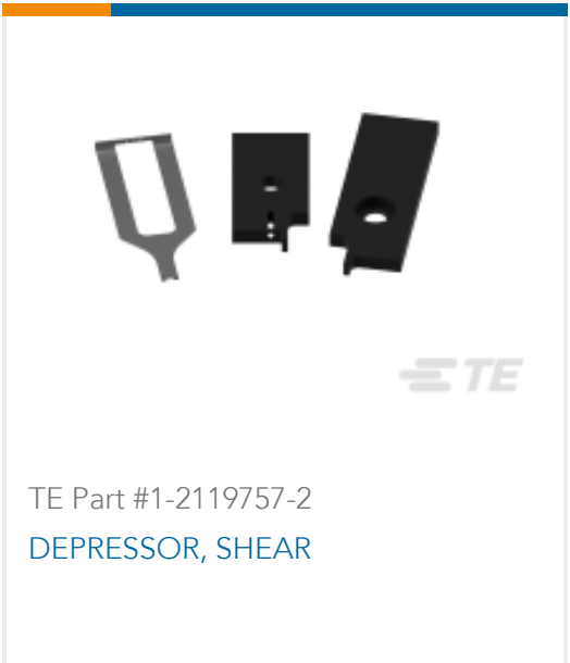
TE Part #1-2119757-2 DEPRESSOR, SHEAR