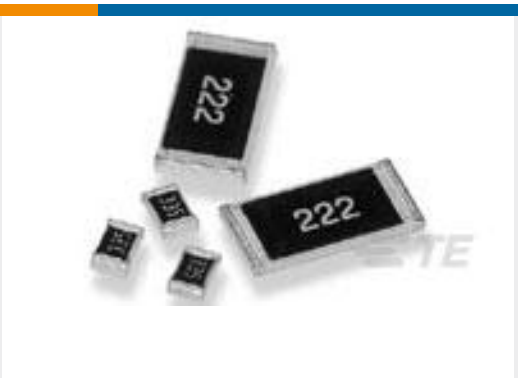
TE Part #1623257-1 CRG0805 1% 5K1