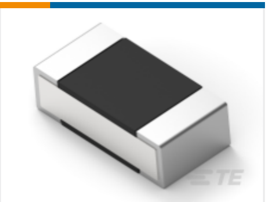
TE Part #5-2176308-4 RP 1E 0.1W 8R25 0.1% 25PPM 1K RL