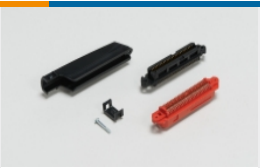
IDC D-Sub Connectors(66)