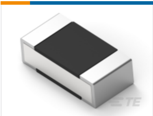
TE Part #2176304-5 RP 1E 0.1W 11R 0.1% 25PPM 5K RL