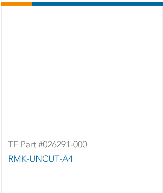
TE Part #026291-000 RMK-UNCUT-A4