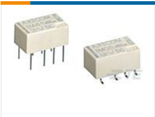
TE Part #1462039-4 IM13GR=IM RELAY 100mW 5V