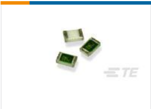
TE Part #5-1879337-9 CPF 0603 10K 1% 50PPM 1K RL