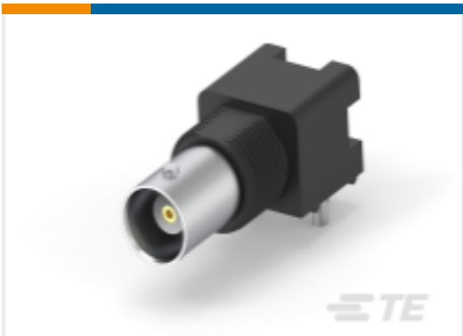
TE Part #5227161-1 BNC RF Connector: Male (Jack), Right Angle