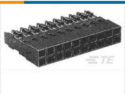
TE Part #3-5102935-6 LEVEL V ASSY DR .125CL, 40, LE