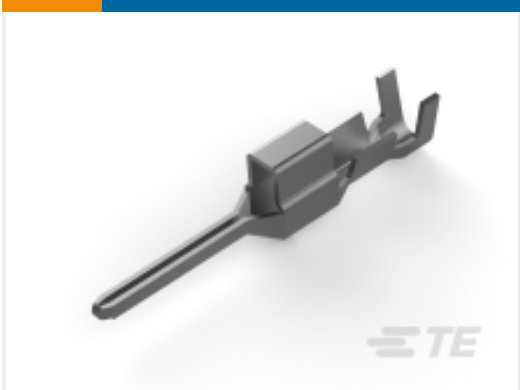
TE Part #917764-1 Signal Double Lock Tab