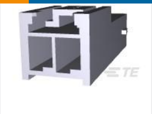
TE Part #179463-6 AMP POWER DBL LOCK CAP HSG 2P