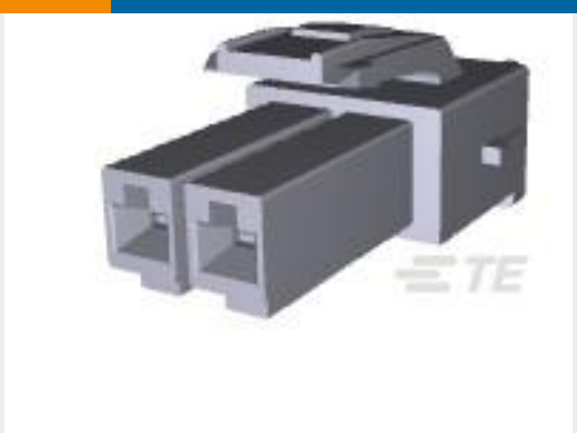
TE Part #177898-6 POWER DBL LOCK PLUG HSG 2P