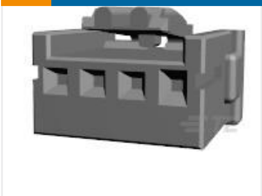
TE Part #917688-1 SIGNAL DOUBLE LOCK PLUG HSG 4P NATURAL