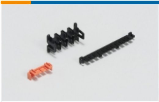
Rectangular Connector Locking(2)